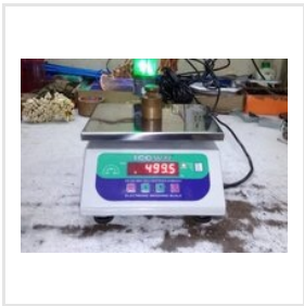
Check Weighing Scale