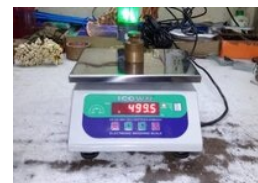
CHECK WEIGHING SCALE