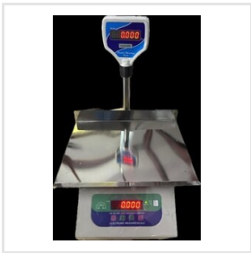
Table Top Weighing Machine